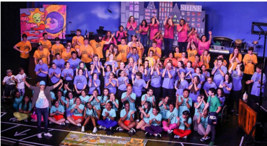
SHINE February 2020

One year ago, just before the pandemic hit, our CREATE Performing Group joined Grammy award-winner Jason Mraz in a new musical adventure, SHINE . Twenty-five students and alumni performed two sold-out shows at the Spreckels Theatre alongside Jason and other youth arts groups. It is hard to believe only twelve months have passed since this incredible experience.